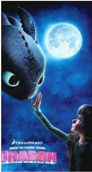
Friday June 3rd at 8pm