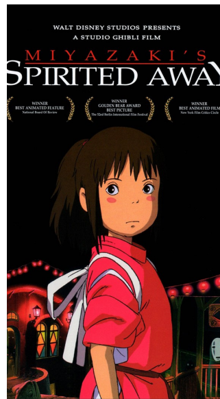
Friday July 9th at 9pm