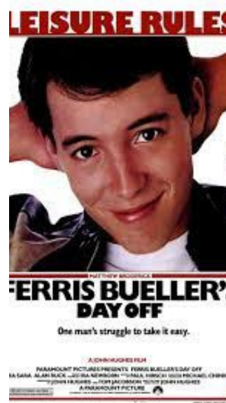
Friday August 6th at 8:30pm